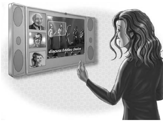
Figure 2 Drawings of a storyboard for MyVideos .

them to empathize with (imaginary) users and their experiences, and to more vividly imagine the sort of problems that TA2 aims to solve.