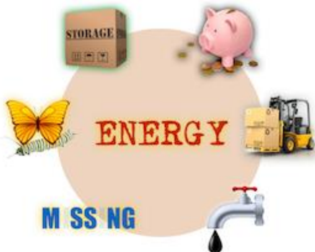
Figure 1: Multiple metaphors for energy. Illustration by Punya Mishra. (© Punya Mishra)

Using multiple metaphors allows students to appreciate the richness of the construct and the complex relationships where it occurs. Figure 1 contains an artistic representation, showing how multiple metaphors can enhance STEM through language arts, with opportunities to create visuals through artistic representation. Having students do their own representations of metaphor offers natural art and language hooks to STEM education.