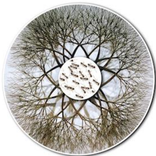
Figure 2: Complex systems are dynamic, self-organizing, evolving networks that can operate without central control (e.g. ant colonies, rainforests, human brains, or cities). Illustration by Punya Mishra. (© Punya Mishra)

In teaching fractals or complex systems, educators may find it useful to start with everyday examples (such as broccoli and tree-branching), and then let students zoom in or out across different scales of magnitude, from twigs to branches to trees, to demonstrate how the part represents the whole. Similarly, complex systems such as the networks in ant colonies can be compared, by zooming in, to the circulatory system in our bodies—or by zooming out, with the streets and physical networks in cities. Making visual creations, like figure 2, allows students to play with ideas, considering how synecdoche occurs across scales, with opportunities to re-see the world.