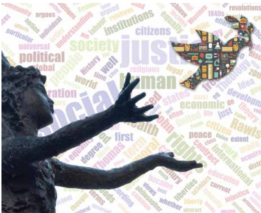
Fig. 3. The dove with an olive branch, a symbol of peace. Made from icons representative of science, flies against a word-cloud created from all the words in the Wikipedia page on “Social Justice.” Credits: Photograph and Illustration by Punya Mishra, 2016. License: CC-BY-NC.

How to implement: Each component of this model is important, but teachers must use all three to support social justice actions with science knowledge.